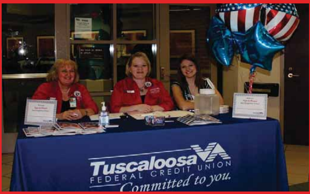
Tuscaloosa VA Federal Credit Union employees wait to greet members at the Annual Meeting.