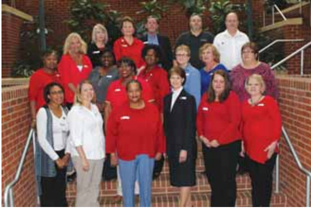
Tuscaloosa VA Federal Credit Union Staff.

The Tuscaloosa VA Federal Credit Union's 66th Annual Meeting was recently held at the VA Medical Center Sport Atrium. Hors d'oeuvres were served in the Activity Room on the VA Medical Center campus, while members mingled and reacquainted with coworkers and friends.